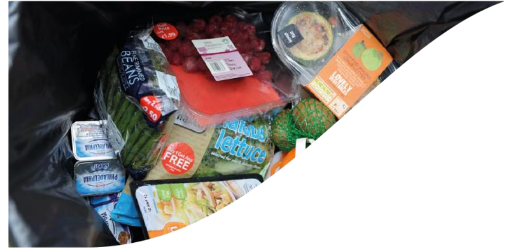
Consumers 7.3 million tonnes