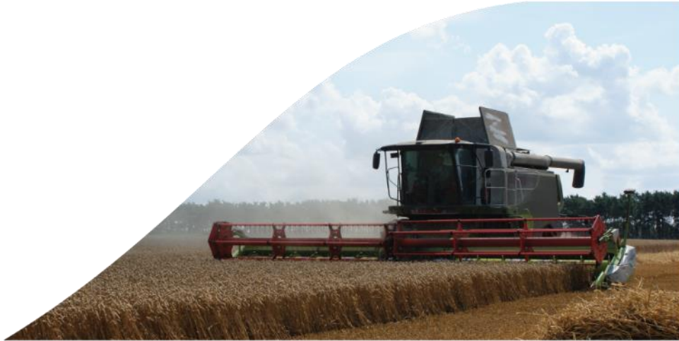
Produce 1.7 million tonnes