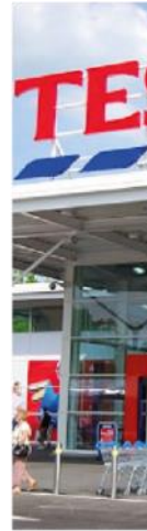
Retail 0.2 million tonnes